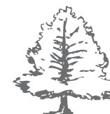
XII Dawn Redwood ( Metasequoia glyptostroboides )