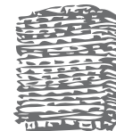
V 1200 Lakeshore Apartments