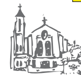
IV Our Lady of Lourdes Church