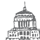
VI Alameda County Courthouse